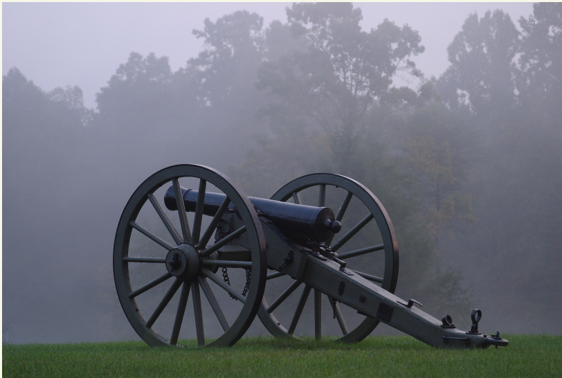
Cannons were common on the battlefield.