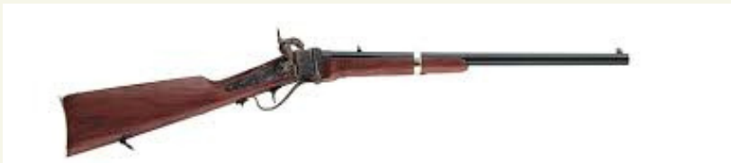
Soldiers on the field often carried Sharps carbines.