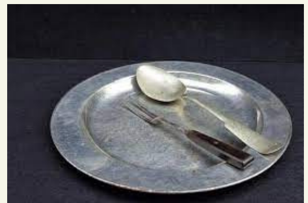
A plate and utensils were sometimes used at meal time.