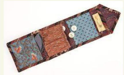
Soldiers carried a sewing kit to fix their uniforms.