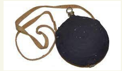
Canteens were important for carrying water.