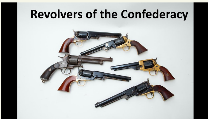
Some soldiers would use a revolver.