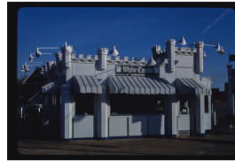
Modern White Castle

A new kind of place to eat began in Wichita, Kansas since people were starting to drive more. It was called White Castle. The diner served square burgers with onions and a pickle on top of a bun. Customers would put on their own ketchup and mustard. McDonalds serves this kind of fast food now. In 1921 it was a new kind of meal that you could get faster.